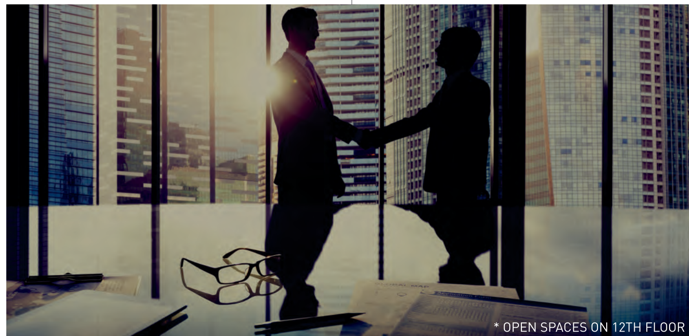
* OPEN SPACES ON 12TH FLOOR